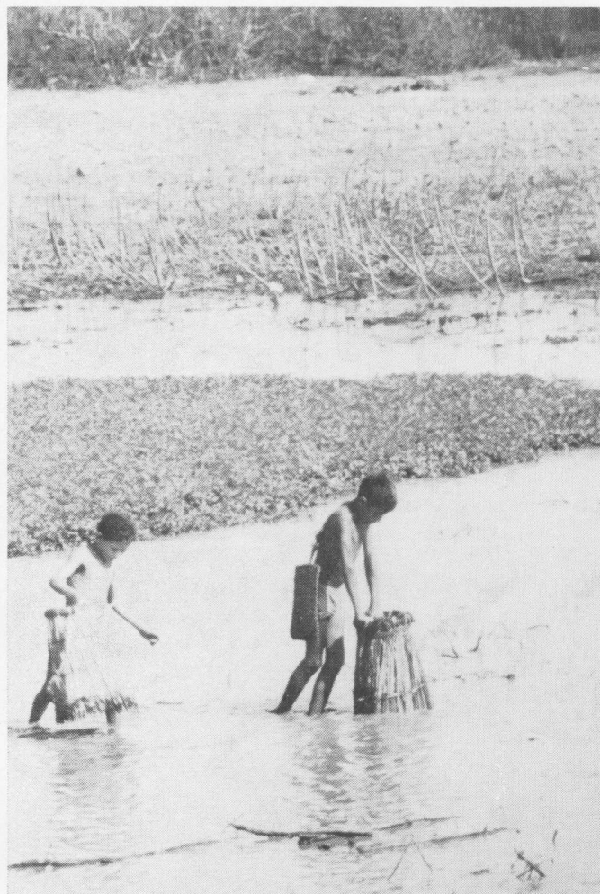
Rural families supplement meager diets by eating fish captured in drying borrow pits and small ponds. Boys fish with "choqus" or thrust baskets.

For the 1-year period beginning in April 1973, total pro-