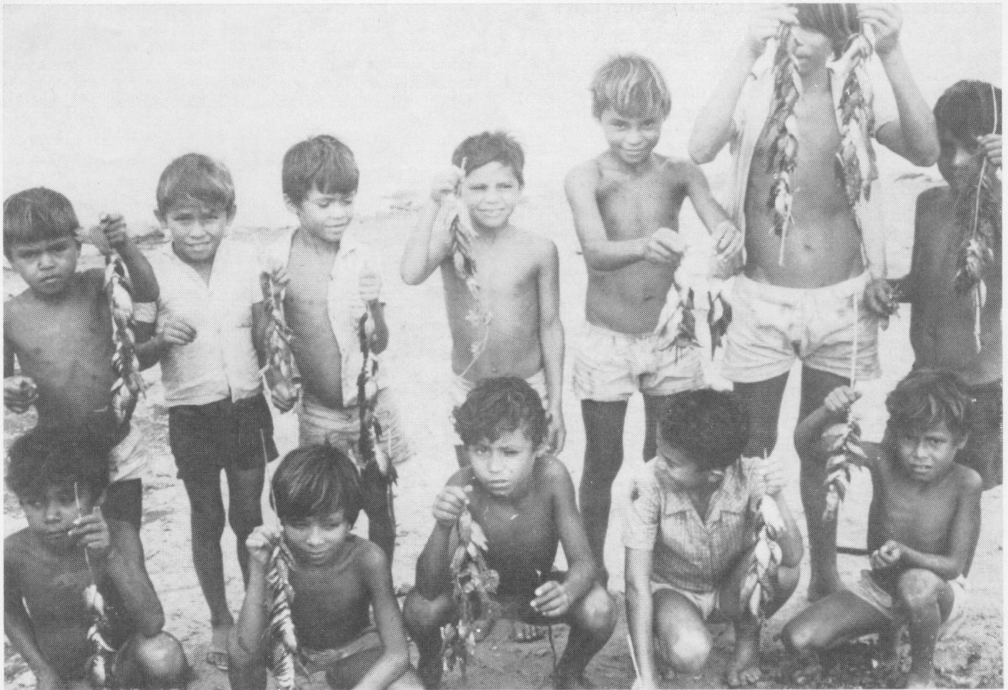
No fish is too small for this group of young fishermen who display their catch.

during the year, mostly during the dry season. There are hundreds of thousands of similar bodies of water in the Northeast. If many or most of these were managed similarly, a significant amount of fish protein could be produced each year. Even a limited program of stocking these waters could have considerable impact on the diet of the rural poor.