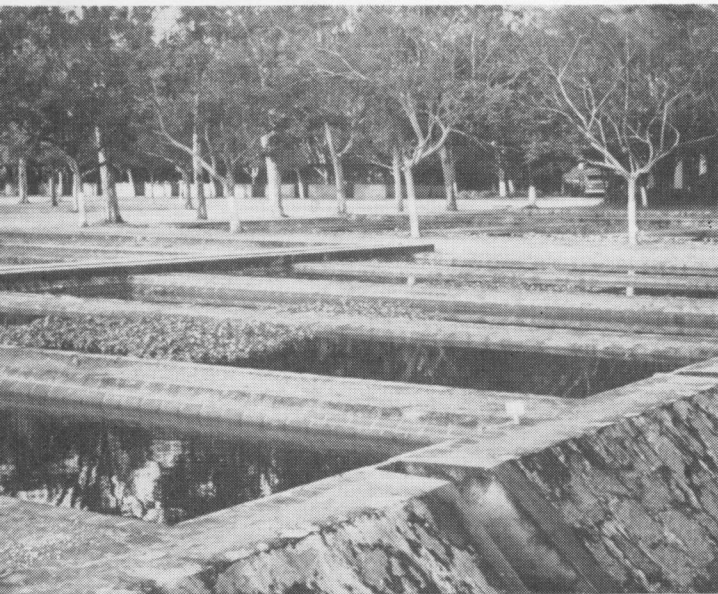
Top: Tilapia hybrid production tanks located at DNOCS Waldemar de Franca fish hatchery in Maranguape, Ceara. Area of each tank = 36 square meters. Center: Harvest of 7-hectare pond located in the Sao Francisco River Valley. Bottom: Results of a harvest. Annual profit reached Cr$2,466 per hectare for this farmer.