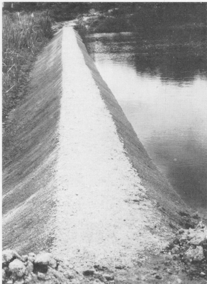
Dam and 8,000-square-meter fish pond on the "Fazenda Passagem Franca." Total annual fish production should be about 4,500 kilograms, worth more than Cr$18,000 at present retail prices (U.S. $1.00 = Cr$6.68).

age systems. Then, after a process of selection, small peasant farmers are given a house to live in and 5-hectare plots of land to cultivate under the supervision of DNOCS agronomists.