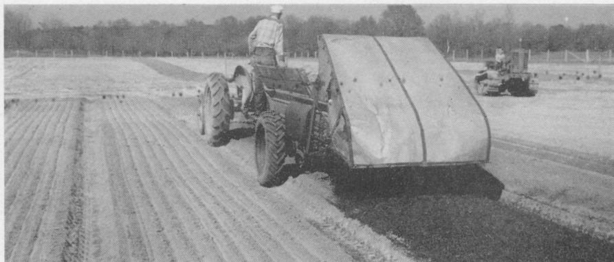
FIGURE 1. Standard manure spreader, with added home-made metal hood, is used to apply sawdust mulch to slash and loblolly pine seedbeds in nursery tests.

Seed of southern pines are customarily sown directly on the surface of the ground in flat seedbeds 4 feet wide. As protection for the seed and the seedbed, a mulch is applied immediately after sowing. The germination periods vary between 8 and 30 days, depending