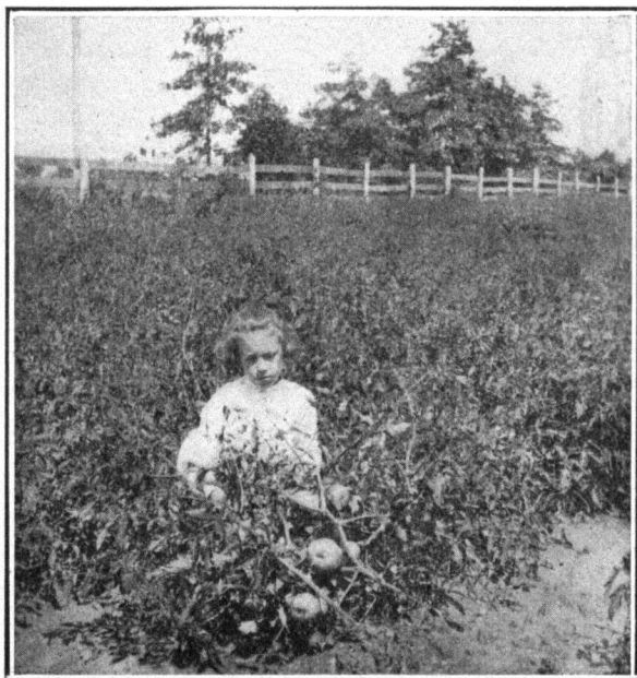
A Successful Crop.

The Extension Department in this institution was created and is maintained jointly by the Farmers' Co-operative Demonstration work of the United States Department of Agriculture, and the Alabama Polytechnic Institute, Auburn, Alabama.