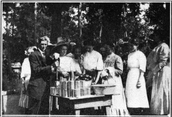
The Mothers Take an Interest

at a lower cost and saves the vegetables otherwise often wasted.