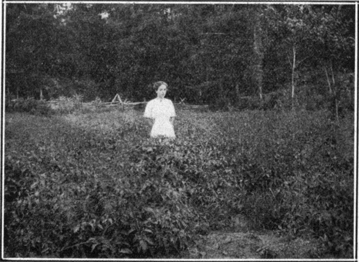
About 300 Cans Were Gathered From This 1-10 Acre

Women over 21 may become honorary members, receive literature and instructions and have all the privileges of the club except that they will not be allowed to contest for prizes.