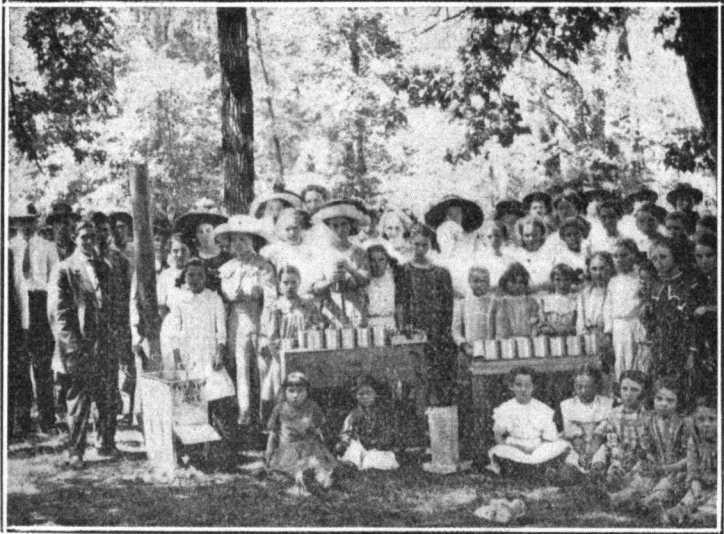
A Canning Picnic

Below is given a partial report from one of the 11-year-old members in Walker county: