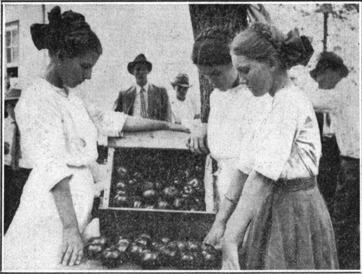
The Girls With Their Product