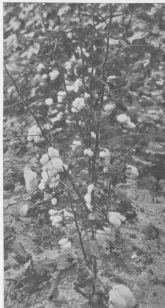
Dusted—1495 Pounds Seed Cotton