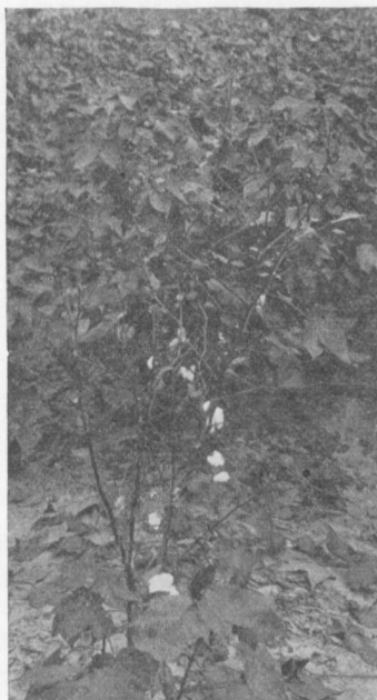
Undusted—565 Pounds Seed Cotton