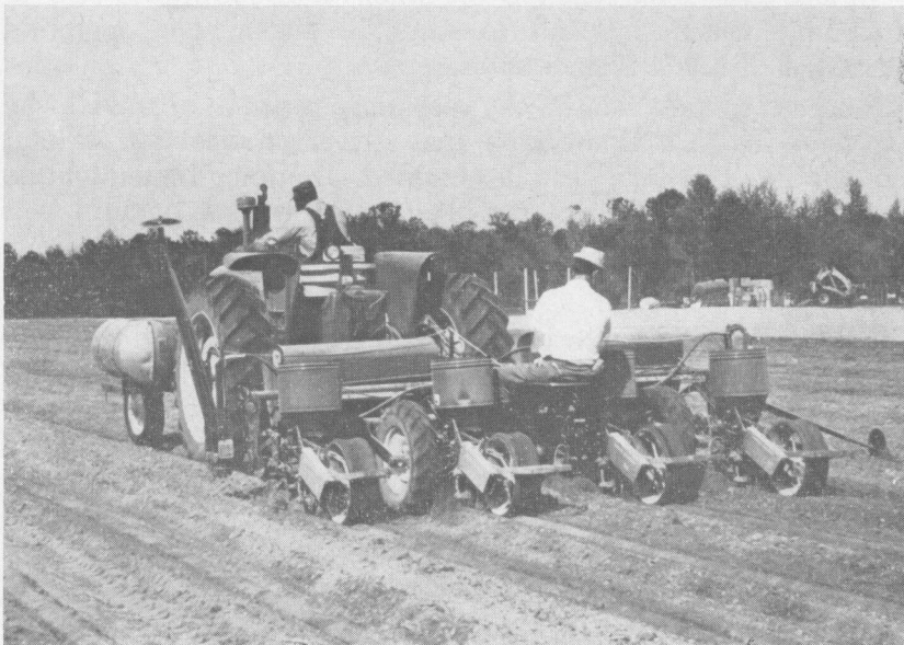
FIG. 2. When planting, long-row fields are more efficient for machinery use than short-row fields.

Turning time is influenced by row length. An acre of long rows has fewer turns than an acre of short rows. When turning time is excessive, the farm manager should examine field size, row arrangements, terrace layout, and row length to determine if changes can be made to reduce turning time and thus improve efficiency.