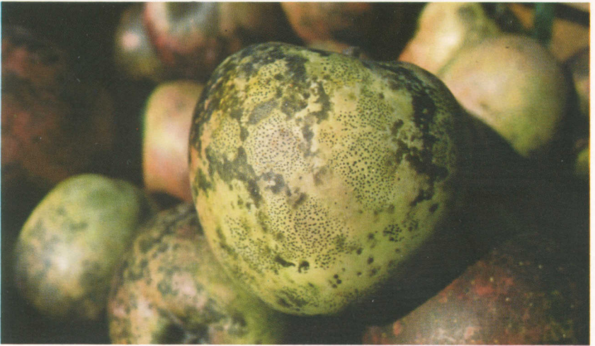
Appearance of this apple with its many pin point spots is typical of fruit infected with sooty blotch disease.

the second (11,12) to fourth (7,13) cover spray, and continue until harvest. Timing fungicide applications according to such schedules does not appear to coincide with development of the diseases in Alabama. Both fungi are active during humid, cool spring weather, but may be entirely absent during hot, dry, summer weather (2). In Alabama, control of sooty blotch and flyspeck was poor with a dodine + ferbam blossom spray followed by folpet cover sprays, or a season long application of metiram, mancozeb + dinocap, thiram + folpet, dithianon, or with thiofanate methyl (9).