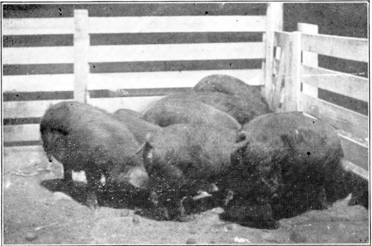
Lot 1 which received mineral