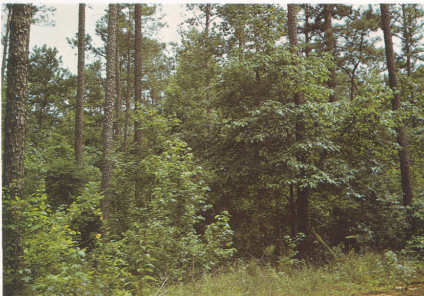
FIG. 1. View of untreated check plot at the end of the treatment period. Hardwood understory has become a dense midstory.