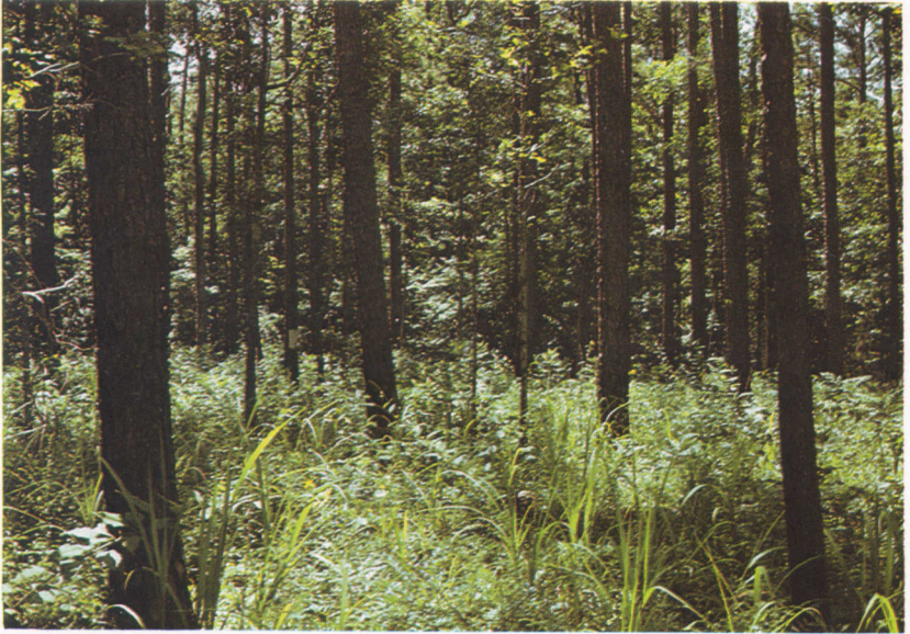
FIG. 6. View of plot four months after seventh winter-burning. Untreated area in background.