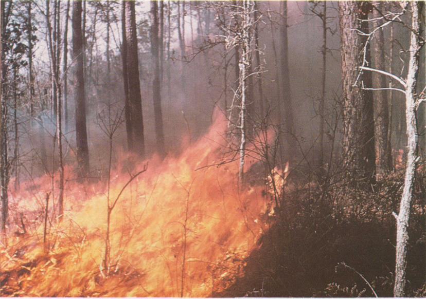
FIG. 3. Strip headfire burning up-slope in winter in a two-year rough.