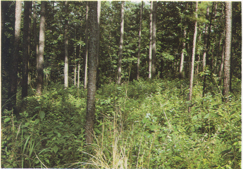
FIG. 7. View of plot nine months after fifth summer-burning. Untreated area in background.