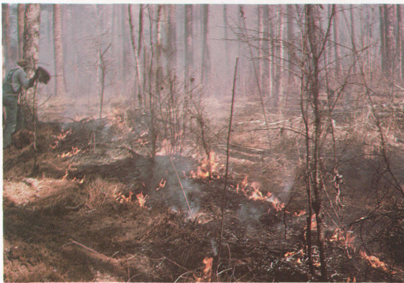
FIG. 2. A strip headfire being set