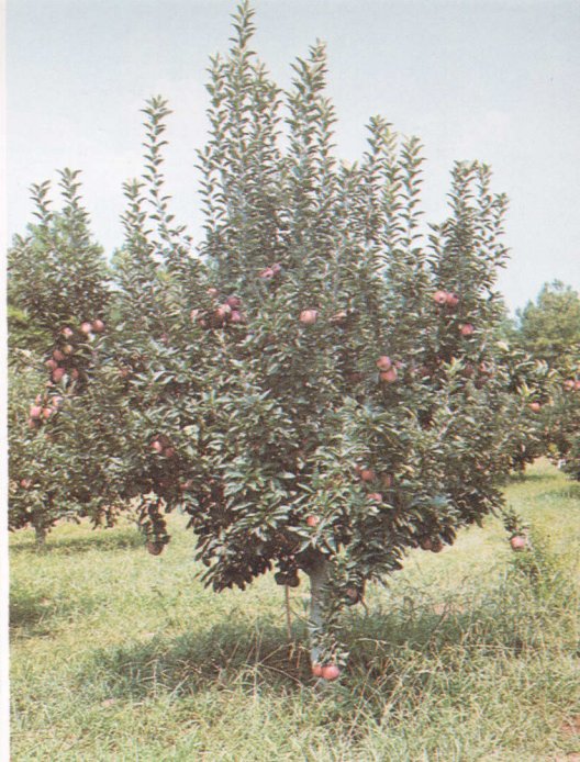
Typical appearance of trees on the four rootstocks tested are illustrated. Left to right are MM 104, MM 106, MM 111, and seedling.

on the terminal growth of trees were larger in the case of trees on MM 106 rootstock than for trees on MM 104 rootstock. The leaves from the terminal growth of trees on seedling rootstock did not differ in size from those of trees on MM 104 and MM 106 rootstocks.