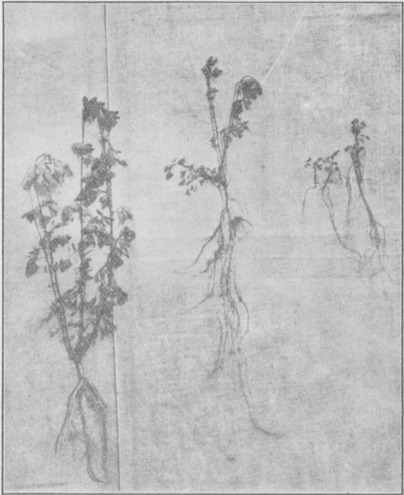
Fig. 2. Small plants not inoculated; central plant, not limed; largest plant, inoculated and limed.

the upper part of Figure 1. Figure 2 shows typical plants taken in April from each plot. Note the abundance of tubercles on the plants from the plot that was both limed and inoculated. The liming and inoculation seemed to make the young plants hardier and more resistant to cold. No one of these plots was a success, there being left at the end of winter only about half a stand on plot 5, and much less on the other two plots. The total yield for the season was 2,266 pounds per acre where liming and inoculation had been employed, while on the other plots there was not enough hay to be raked.