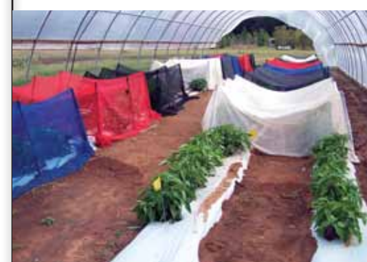
TUNNEL VISION —These beautiful orange bell peppers that are almost ripe are growing in a high tunnel at the Alabama Agricultural Experiment Station's E.V. Smith Research Center in Shorter as part of Auburn University

Smith's research will provide key technical information for cost-effectively restoring valuable rivercane ecosystems to the region.