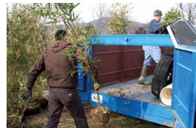
TAKING ROOTSTOCK —Workers load rivercane plants freshly dug from a north Alabama site onto a trailer bound for greenhouses at Roundstone Native Seed in Kentucky as part of a rivercane restoration study AAES wildlife scientist Mark Smith is leading. At Roundstone, technicians are splicing off small sections of the plants' rhizomes and cultivating those sections into small seedlings that eventually will be planted in test plots. Rivercane plants flower and produce seeds only once every 25 or so years, so restoring vast thickets of the native bamboo using seed would be out of the question.

In phase two, the research will move from the laboratory to the field, with the planting of seedlings in three five-acre test plots in north Alabama.