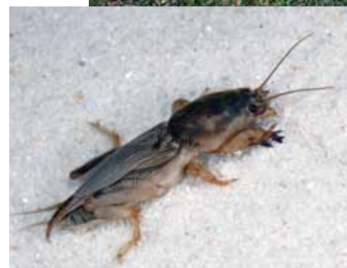
SOLID EVIDENCE —The small mounds of dirt so clearly visible on this coastal golf course are proof positive that the course is heavily infested with tunnel-digging, turf-destroying mole crickets. Scientists at Auburn are investigating not only how the tunnels that crickets dig affect water's movement through the soil but also whether the insects' burrowing behaviors provide clues for improved control techniques.

At the heart of the multifaceted project are soil macropores, which basically are subsurface pathways in soils through which water flows. In laboratory and field experiments, the scientists will examine how these macropores—or biopores, as those created by living organisms are called—develop