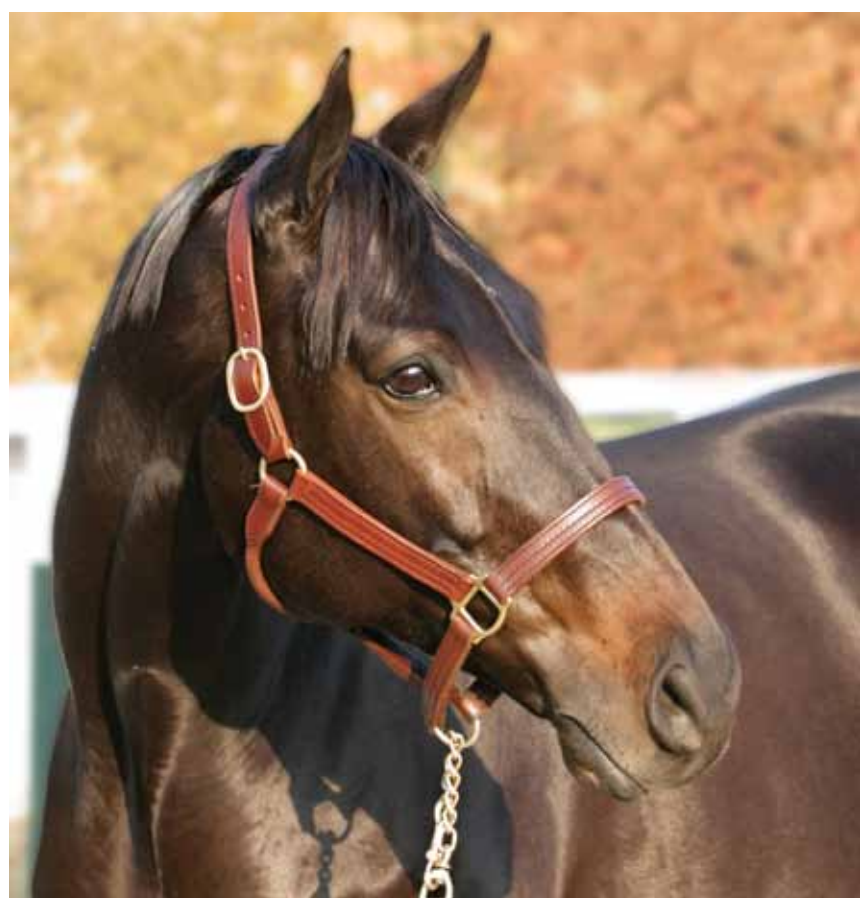
RIDING FOR A CAUSE —Fifteen local equestrians spent a chilly but fun February Saturday in the saddle to raise more than $700 for St. Jude Children's Research Hospital. The event, Saddle Up for St. Jude, was a trail ride at Tuskegee National Forest sponsored by the Auburn University Horseman's Club, many members of which are College of Ag students. More than 21 donors helped make this year's successful ride possible, including several local businesses, and organizers are already planning next year's ride.