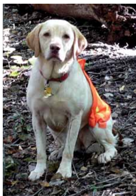
WHAT A NOSE —Blaze, a yellow Labrador retriever, and one of two dogs in the SFWS's rare-animal-detection program, is trained to sniff out the scat, or feces, of spotted skunks. Her brother, Bishop, a black Lab, is trained to indicate on striped skunk scat. The program is expanding and plans are to have dogs trained to locate mountain lion scat and black bear scat so that more can be learned about those rare animals as well.