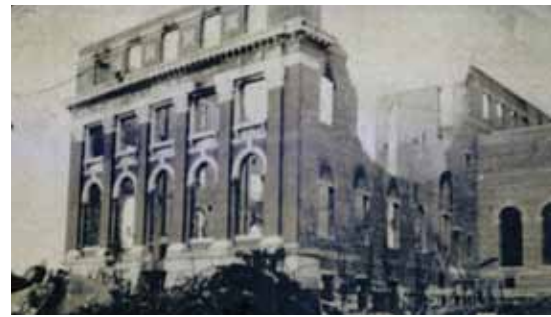
FROM THE ASHES —The front façade of Comer (left) appeared to have suffered less damage than the rear (above). After the October 1920 fire, two plans were proposed for Comer Hall's restoration. One called for wings to be added on the east and west ends of the building to house the Alabama Cooperative Extension Service and the Alabama Agricultural Experiment Station. This plan was scrapped in favor of restoring Comer Hall essentially as it was before the fire, using the surviving walls, which were 30 inches thick at the base, to reduce costs.