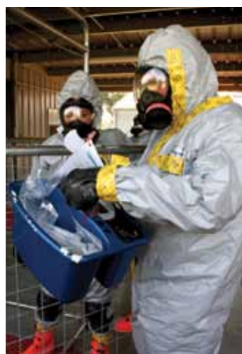
READYING RESPONDERS —AgERT trains first responders on the proper selection and use of personal protective equipment and other critical skills needed to perform during an agroterrorism event.

The AgERT program—the only one offered by the Department of Homeland Security—provides training each year for more than 400 first responders from across the nation and has trained agricultural and traditional responders from all 50 states, four U.S. territories, the Navaho nation, Canada and Mexico.