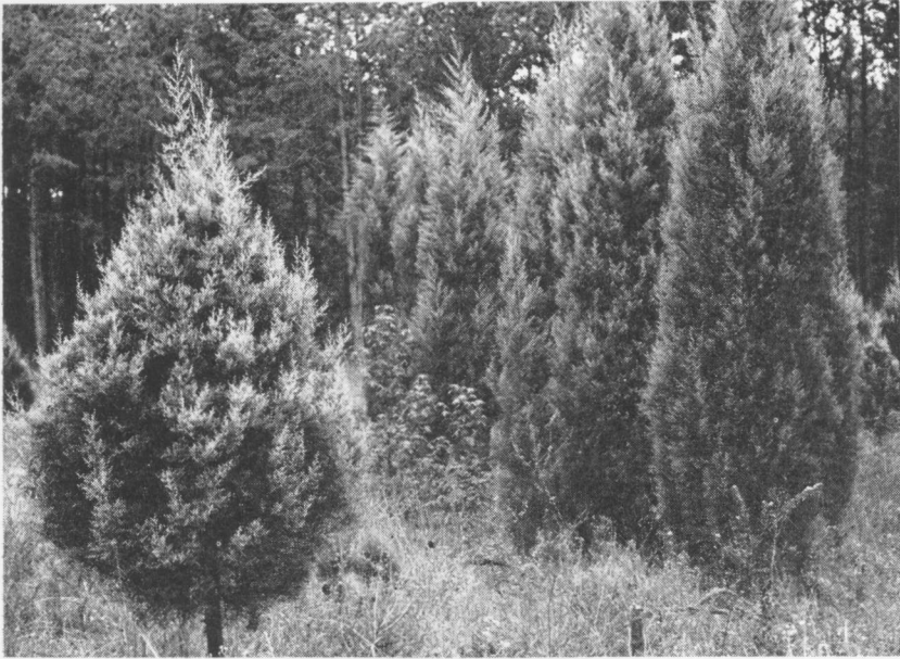
These Arizona cypress show effects of production practices. Well shaped tree at left had proper care and would sell in the competitive Christmas tree market. The poor quality trees at right were not pruned and would bring low prices or even remain unsold.

tured areas are often damaged by livestock. Of course, such chance seeding results in a percentage of the trees growing in favorable spots and developing into satisfactory products. Even though this percentage may be small, the number of usable trees may be quite large because of the total number of trees in the natural stand.