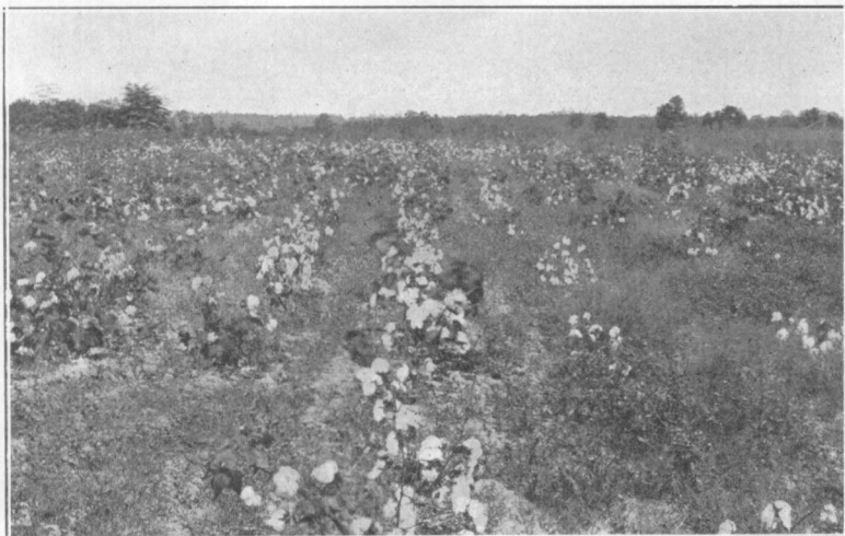
In the centre are the three rows of the original Cook plants tested on severely infested wilt land at Loachapoka. Notice the resistance of the middle row. The plants on this row constitute the beginning of Cook 307-6, a wilt-resistant strain.